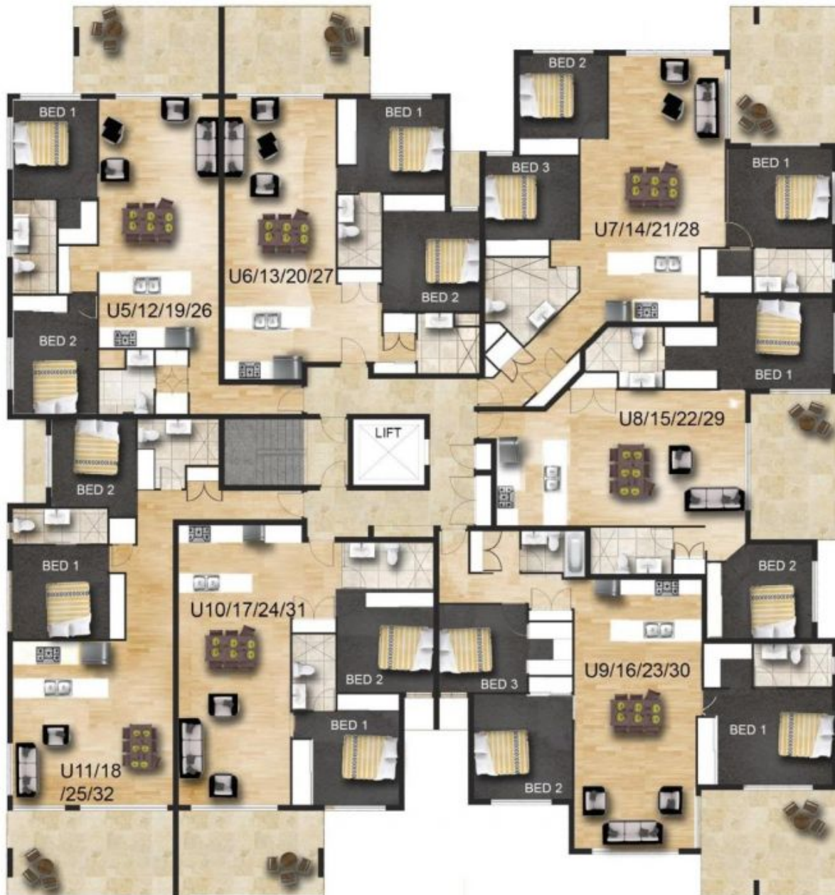
LEVELS 1 - 4