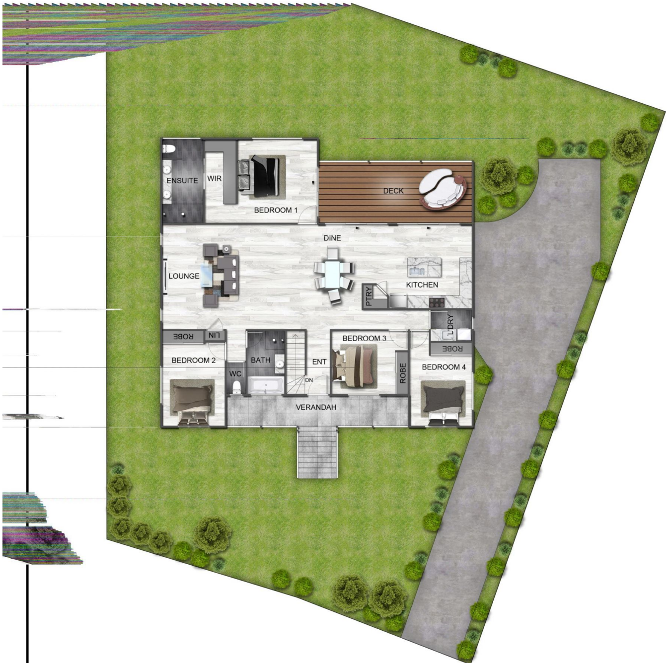
GROUND FLOOR PLAN ON SITE