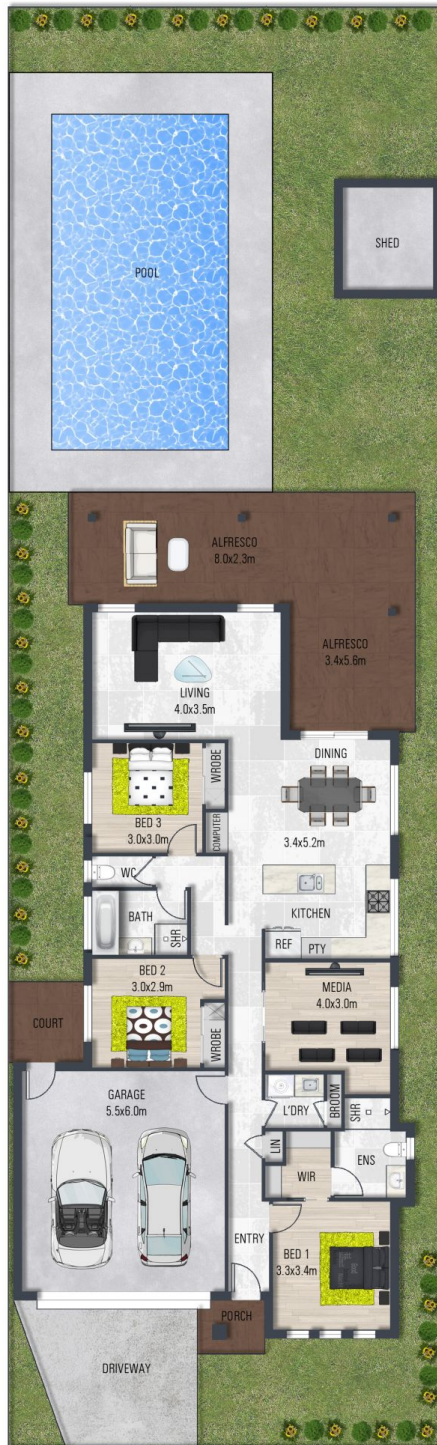
FLOOR PLAN ON SITE

This floor plan including furniture, fixture measurements and dimensions are approximate and for illustrative purposes only. Boxbrownie.com gives no guarantee, warranty or representation as to the accuracy and layout. All enquiries must be directed to the agent, vendor or party representing this floor plan.