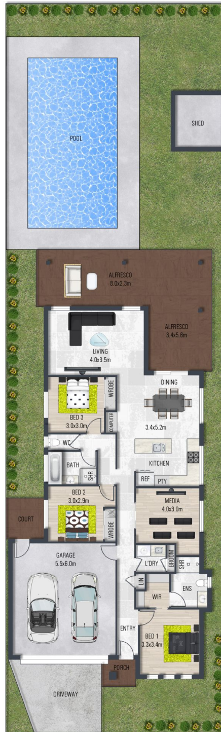
FLOOR PLAN ON SITE

This floor plan including furniture, fixture measurements and dimensions are approximate and for illustrative purposes only. Boxbrownie.com gives no guarantee, warranty or representation as to the accuracy and layout. All enquiries must be directed to the agent, vendor or party representing this floor plan.