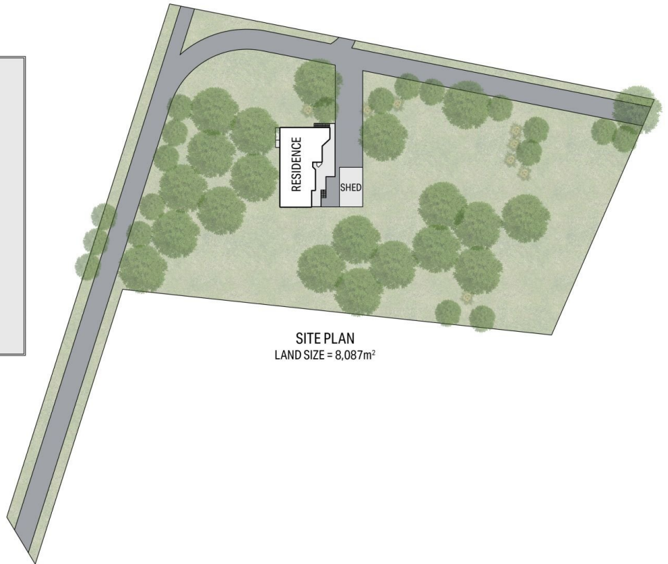
SITE PLAN LAND SIZE = 8,087m 2