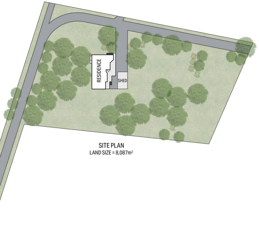
SITE PLAN LAND SIZE = 8,087m 2

This floor plan including furniture, fixture measurements and dimensions are approximate and for illustrative purposes only. BonBrownie.com gives no guarantee, warranty or representation as to the accuracy and layout. All enquiries must be directed to the agent, vendor or party representing this floor plan.